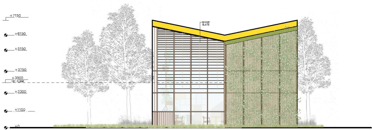
RIGHT ELEVATION 1:150