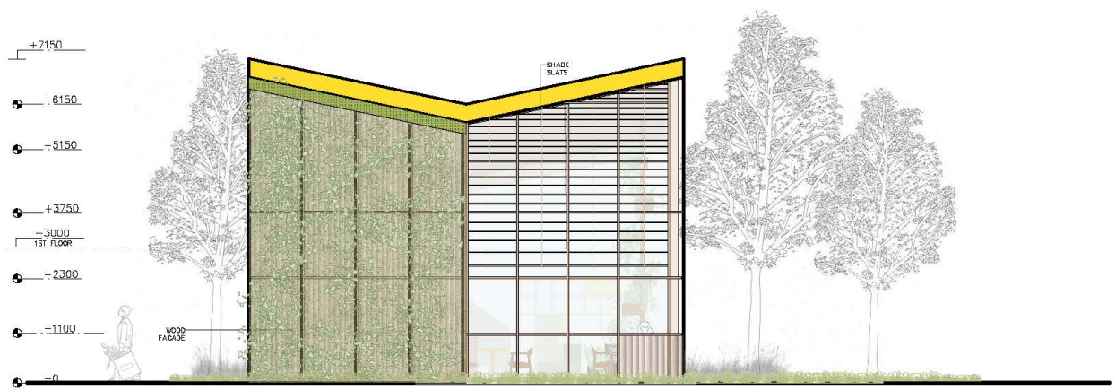
LEFT ELEVATION 1:150