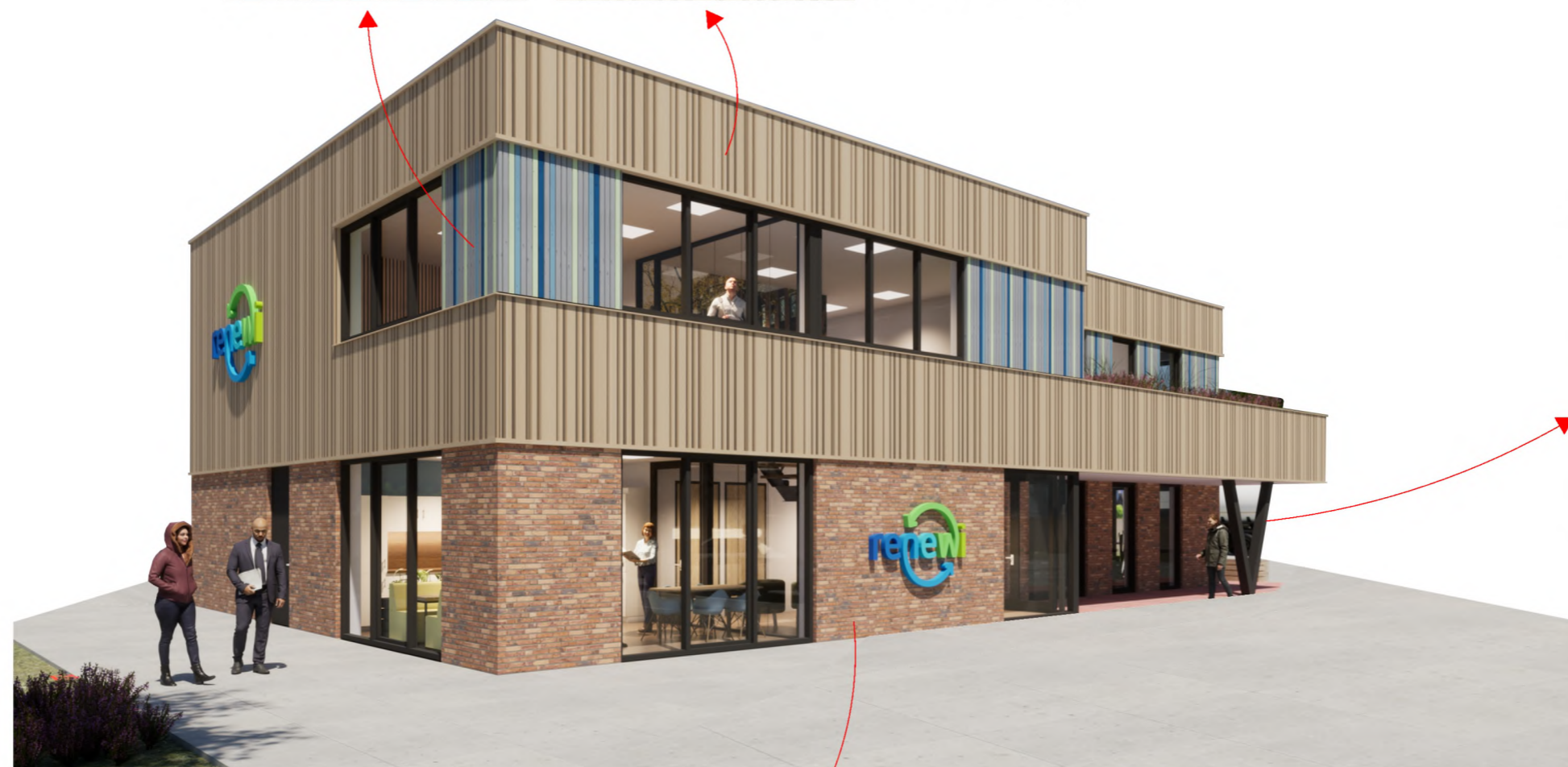
RAL 9004 ST