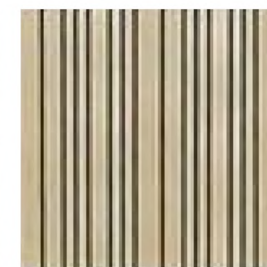
staal nokken profilering