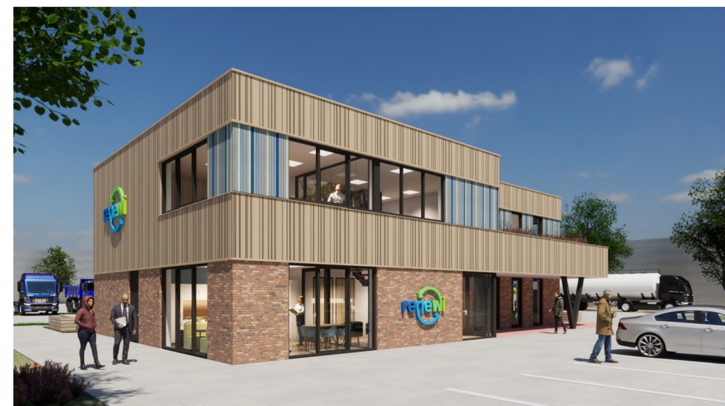
Nieuwbouw kantoor Renewi Moerdijk 22057 | TO | 1-2-2023