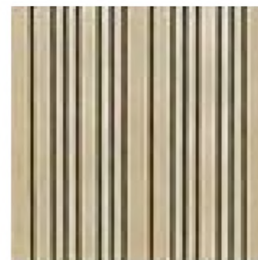
staal nokken profilering