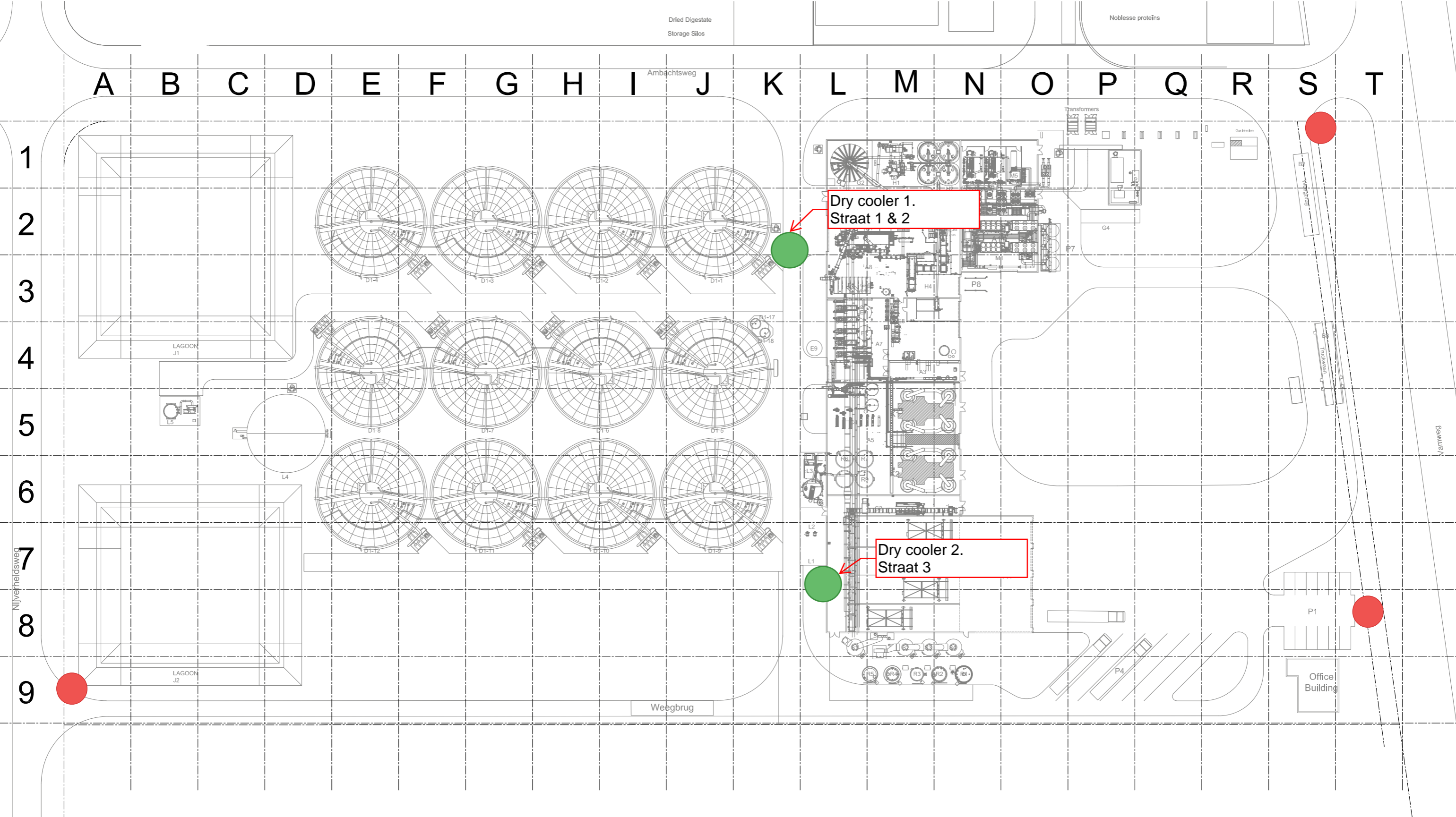
Existing Site Plan Scale 1:400