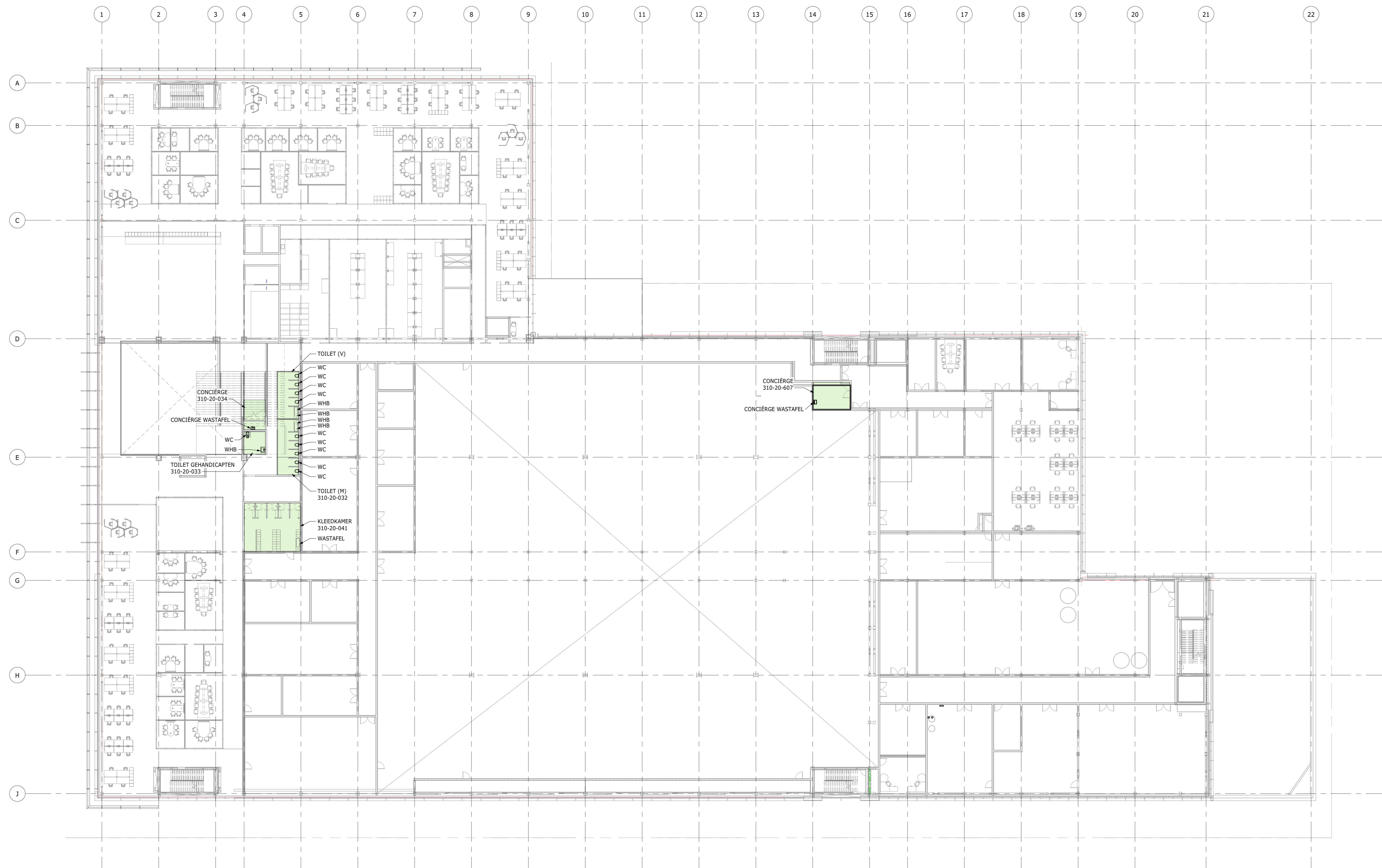
LEVEL 02 - DUTCH WATER OUTLETS FIRST FLOOR LAYOUT SCALE: 1 : 200

NOTICE DE TEKENINGEN EN ANDERE INFORMATIE OP DEZE TEKENING ZIJN EIGENDOM VAN BRISTOL MYERS SQUIBB. TECHNICAL OPERATIONS DIVISIONS, FACILITIES ENGINEERING EN WORDT AAN UITBREIDEND ONDER VOORBEHOUD VAN TERUGNAME OF VERZOEK EN OP DE UITDRUKKELIJKE VOORWAARDE DAT ALLE VERTROUWELIJKE ONDERWERPEN STRIKT VERTROUWELIJK WORDEN GEHOUDEN EN NIET ZAL WORDEN GEBRUIKT OP ENIJ. NIJZ DE SCHAKELIJK IS VOOR DE BELANGEN VAN BRISTOL MYERS SQUIBB. TECHNICAL OPERATIONS DIVISION, FACILITIES ENGINEERING EN VOOR GEEN ENKEL ANDER DOEL DAN DEZE LENOING.